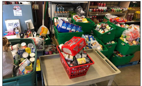
Donations from March 2018 Lead2Feed food drive with Raytown High School.