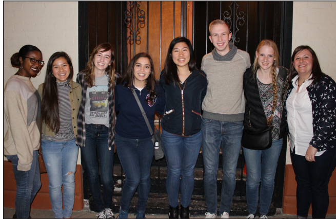
In March, scholars went to First Fridays in the Crossroads Arts District of Kansas City.