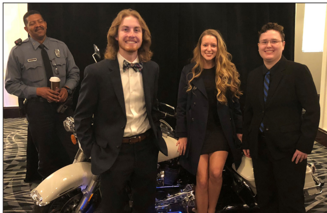
In February, scholars attended A Call for Backup, the KCMO Police Foundation Gala.