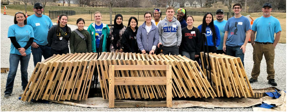
The Scholars with staff from Sleep in Heavenly Peace posing with the 40 head and foot boards they assembled and stained.

By Sydnee Flowers, first-year scholar Sponsor: Scott Boswell/Commerce Bank